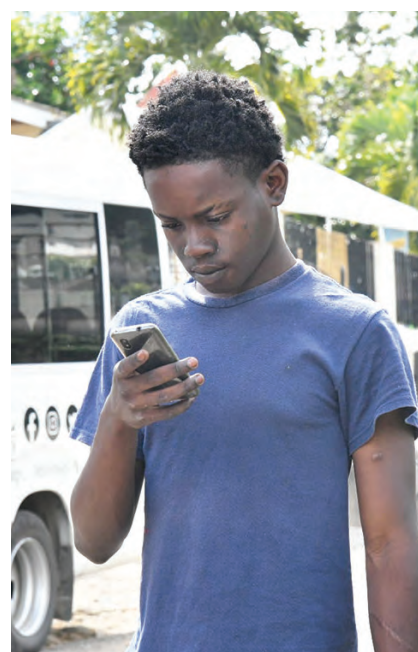
A youngster from Allison, Manchester, uses his smartphone to access free internet service provided under the Government's Community Wi-Fi Programme.