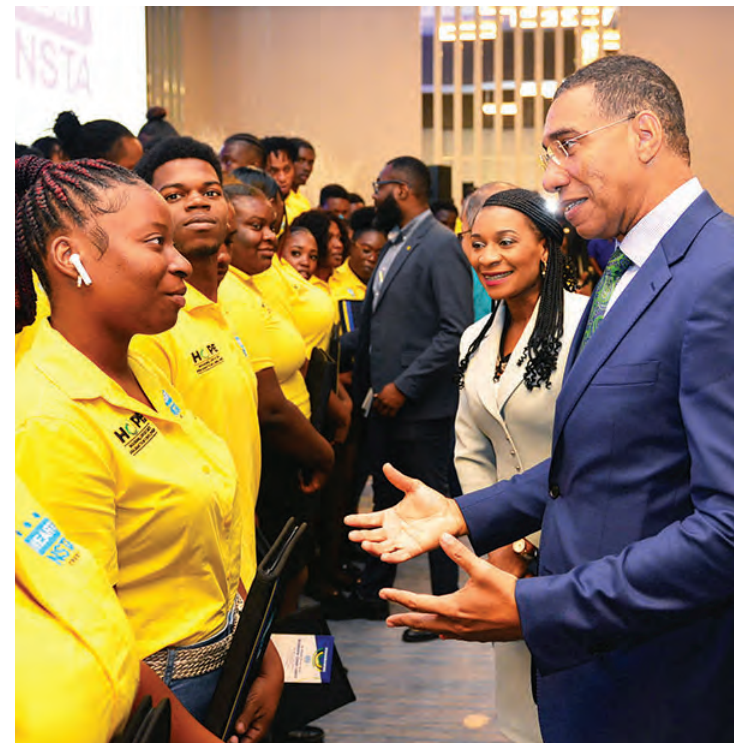
Prime Minister the Most Hon. Andrew Holness (right), speaks with participants in the Jamaica National Service Corps (JNSC) Residential Camps, at the official launch of the programme at the AC Marriott Hotel in St. Andrew.