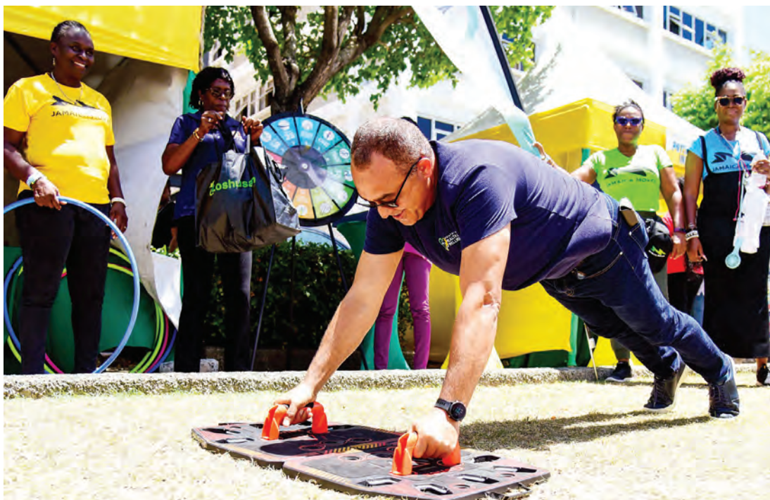
Minister Tufton demonstrates his physical fitness during a Caribbean Wellness Day event on Friday, September 8, at the VMBS grounds on Knutsford Boulevard in New Kingston.