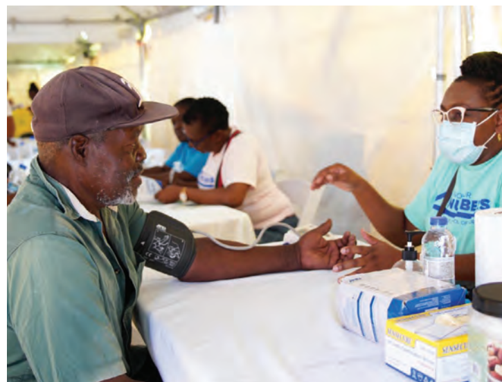
A senior citizen's blood pressure is checked during a 'Know Your Numbers' campaign event in Linstead, St. Catherine in December.