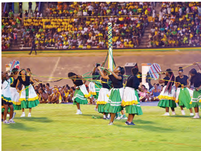
The traditional maypole dance is performed at the Grand Gala.