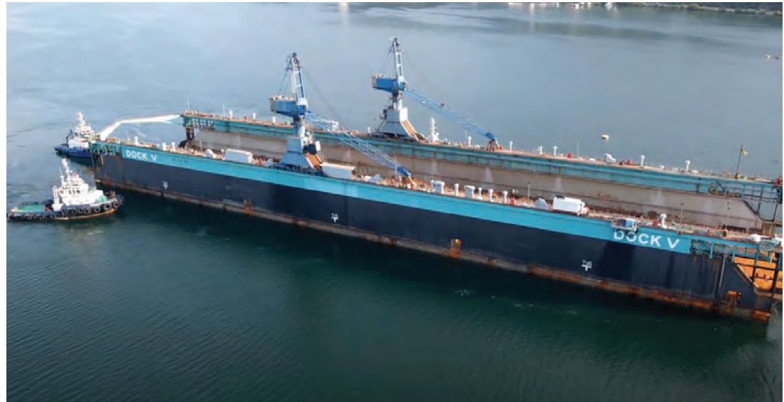
Jamaica's first floating dry dock arrived in August.