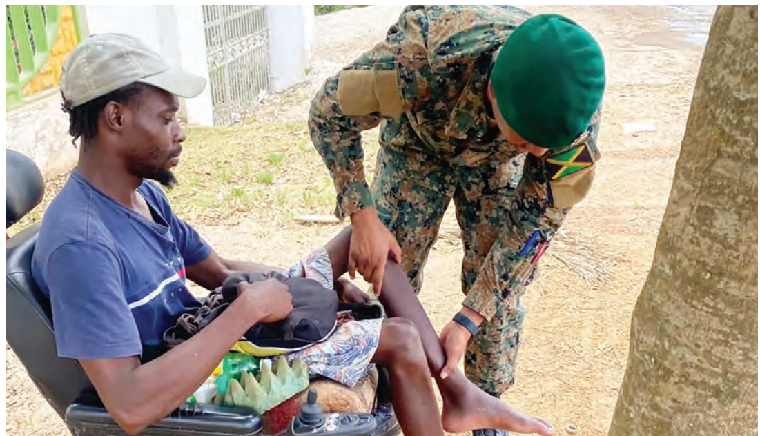
A member of the Jamaica National Reserve (JNR) assists a wheelchair-bound resident, during a health fair at the Golden Grove All Age School in St. Ann in May.