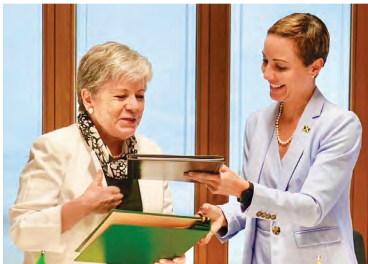
Minister Johnson Smith exchanges signed documents with Mexico's new Secretary of State for Foreign Affairs, Her Excellency Alicia Barcena, marking a new phase of cooperation between the countries.