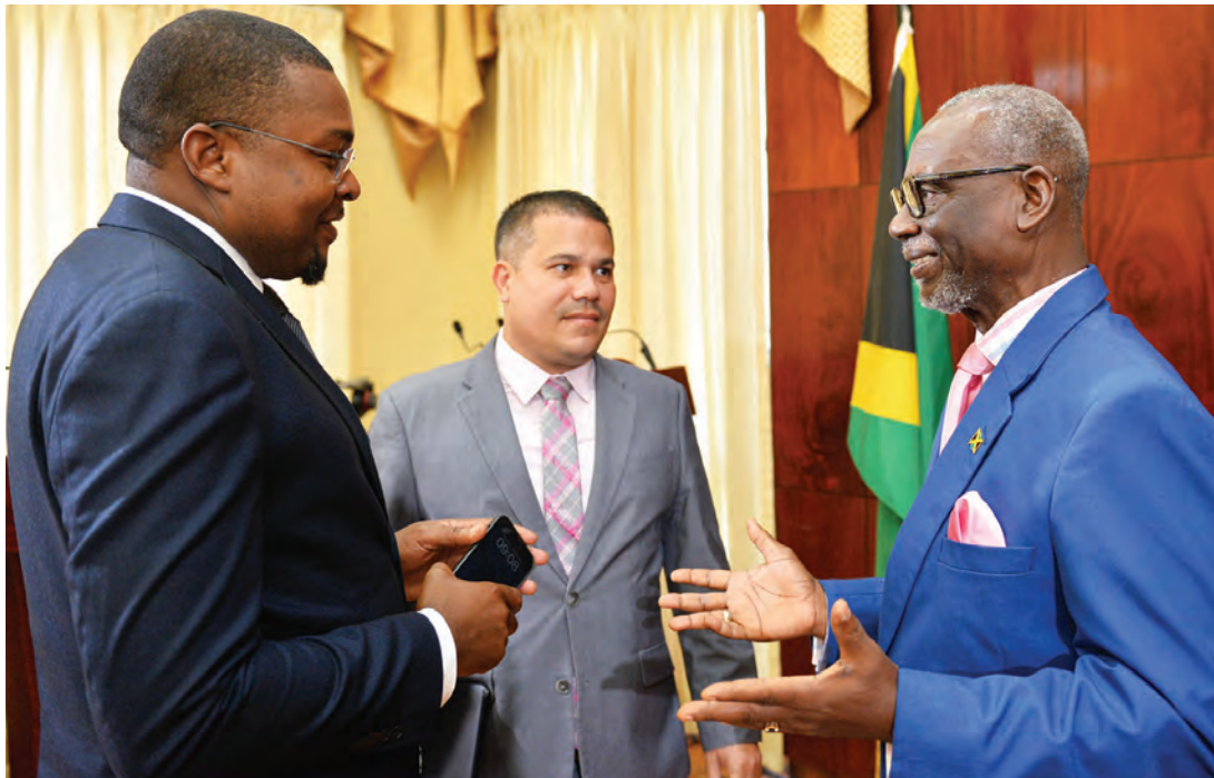
Hon. Robert Morgan (left), in conversation with Minister of Local Government and Community Development, Hon. Desmond McKenzie (right), and Minister without Portfolio in the Ministry of Economic Growth and Job Creation, Senator the Hon. Matthew Samuda.