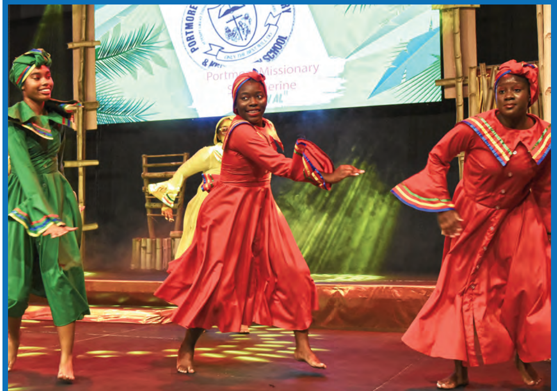
Portmore Missionary Preparatory students perform an item titled 'Revival', during the Jamaica Cultural Development Commission (JCDC) Mello-Go-Roun' showcase in the Independence Village at the National Arena in Kingston.