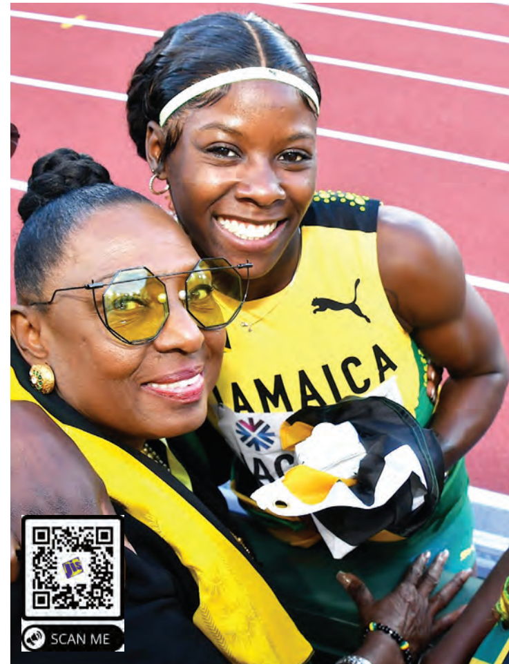
Sports Minister Olivia Grange congratulates Sherika Jackson on winning the 200-metre finals at the World Championships.

and South Africa, which conducted study tours of the country's sports programme.