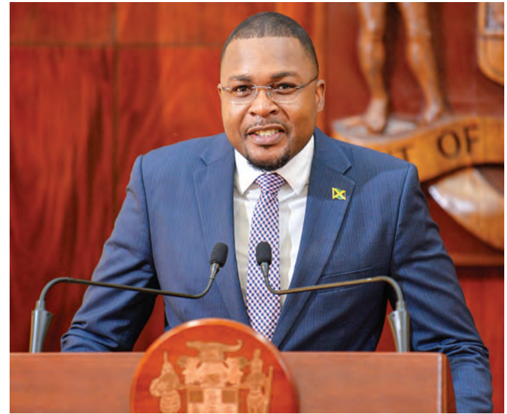
Minister without portfolio in the Office of the Prime Minister with responsibility for Information, Hon. Robert Morgan, addresses the weekly post-Cabinet press briefing.