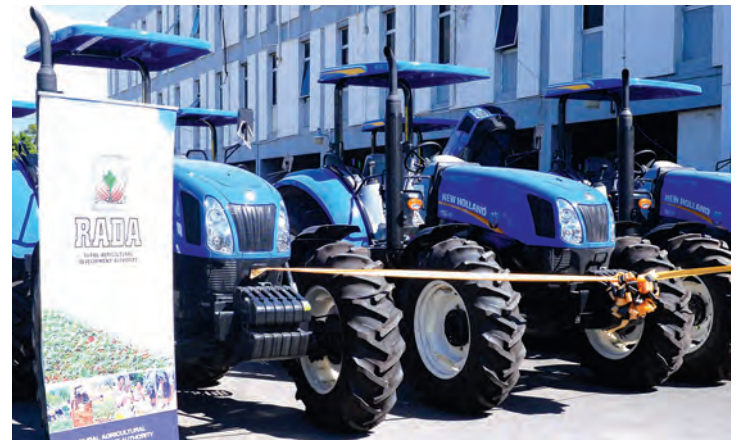
Three of the six farm tractors that were handed over to the Rural Agricultural Development Authority (RADA) in January. The equipment valued approximately $49.7 million.