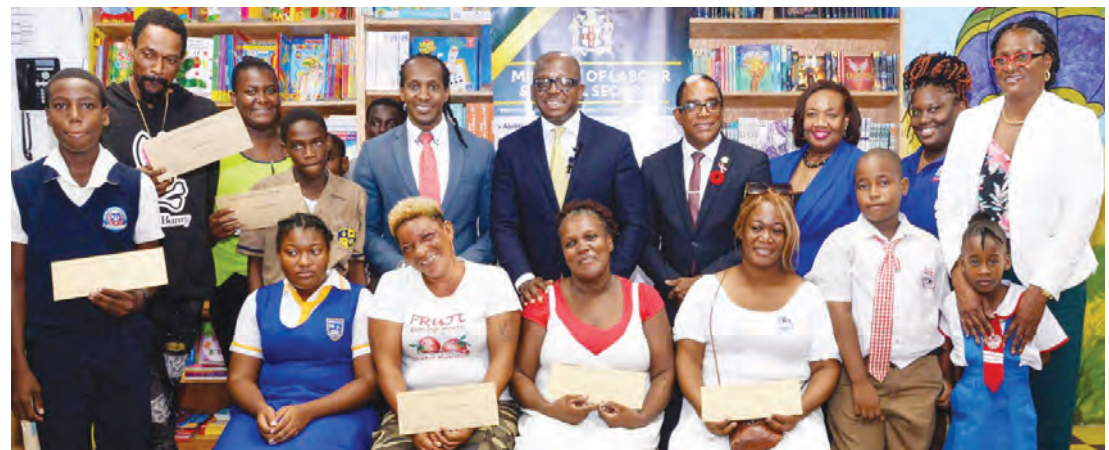
Minister Pearnel Charles Jr (5th left, back row), and State Minister, Dr. Hon. Norman Dunn (4th right, back row), with some of the 15 families, representing 35 students, who were presented with book vouchers, totalling $500,000 to assist with back-to-school expenses. The families were victims of a fire in Gregory Park, St. Catherine in August. Offering support is Member of Parliament for the area, Hon. Alando Terrelonge (4th left, back row).