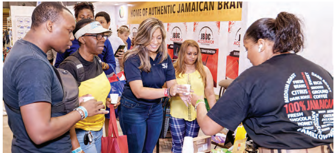
Patrons sample Jamaican-made coffee at the Jamaica Manufacturers and Exporters Association's (JMEA) Expo in May.