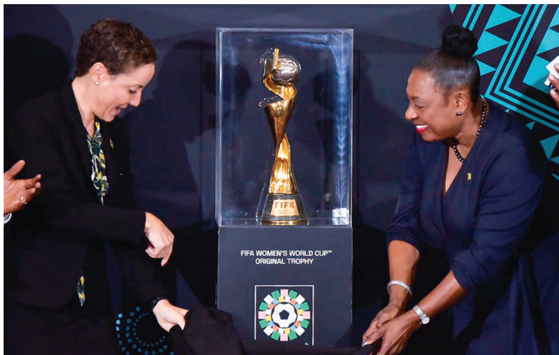
Minister of Culture, Gender, Entertainment and Sport, Hon. Oliva Grange (right) and Minister of Foreign Affairs and Foreign Trade, Senator the Hon. Kamina Johnson Smith, unveil the original FIFA Women's Football World Cup Trophy, during a brief ceremony at the Jamaica Pegasus Hotel in New Kingston. The ceremony formed part of the Jamaica leg of the global FIFA Women's World Cup Trophy Tour in April.