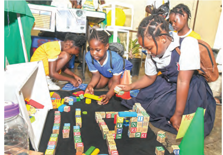
Students of Prospect Primary School playing with number/letter blocks while participating in the Mathematics Exposition held at the school, located in Clarendon, on March 30.