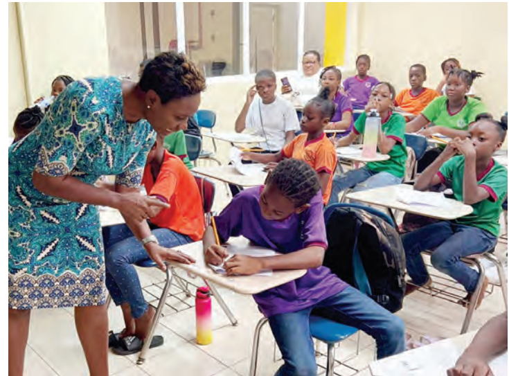
State Minister for National Security, Hon. Juliet Cuthbert Flynn, engages with a student at a summer camp organized by the Ministry.