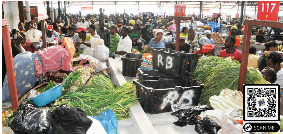
Householders purchasing produce.