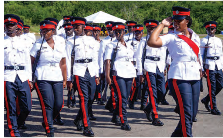
New Jamaica Constabulary Force (JCF) constables at the passing out parade at the National Police College of Jamaica in Twickenham Park, St. Catherine.