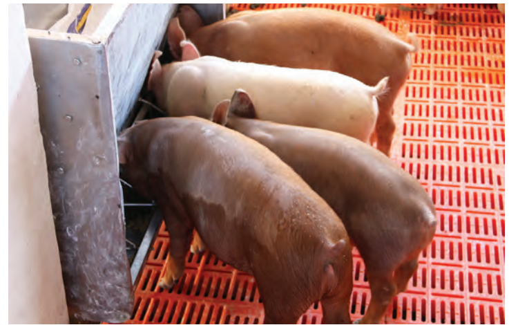
Pigs feed from a trough at the upgraded piggery at the College of Agriculture Science and Education (CASE) in Portland.