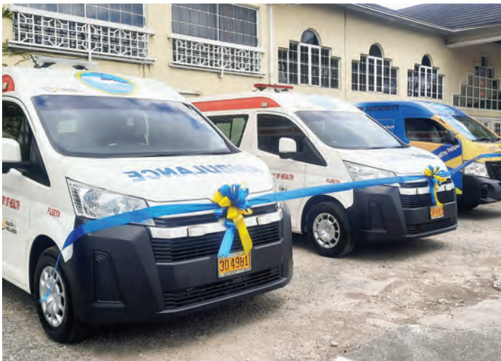
Two ambulances and a panel van, acquired at a cost of more than $33 million, were handed over to the Northeast Regional Health Authority (NERHA) to serve the parishes of St. Ann, St. Mary and Portland.

panel van, at a total cost of $62 million.