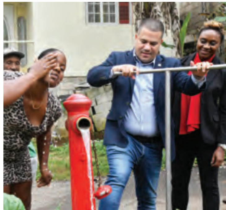
Minister Samuda turns on the water valve at a fire hydrant in Sterling Castle Heights, St. Andrew West Rural, following improvement works by the National Water Commission (NWC). Observing is Minister of State in the Ministry of National Security and Member of Parliament for the constituency, Hon. Juliet Cuthbert-Flynn (right), while resident of Sterling Castle Heights, Suzanne Thompson, cools down during the proceedings.