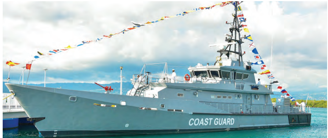
New offshore patrol vessel, His Majesty's Jamaican Ship (HMJS) Norman Manley, was commissioned into service on November 30.