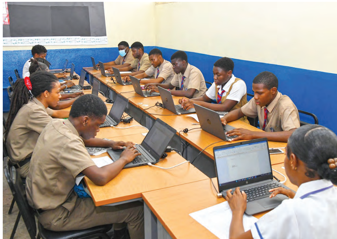
Fourth and fifth form students of Holy Trinity High School in Kingston engaged in a class work using the new laptops provided by the Government.