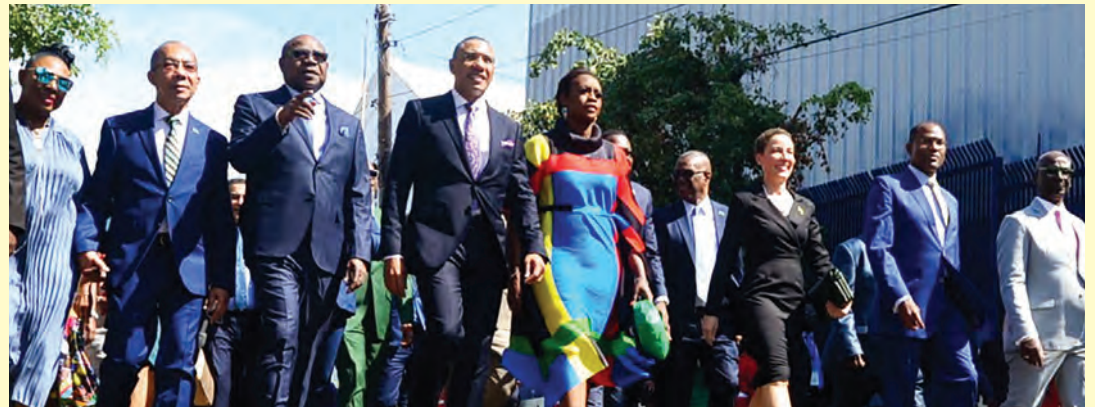
Prime Minister the Most Hon. Andrew Holness (centre) flanked by fellow parliamentarians ahead of the February 14 ceremonial opening of Parliament. The February 14 event returned to its full grandeur after years of COVID-19 restrictions.