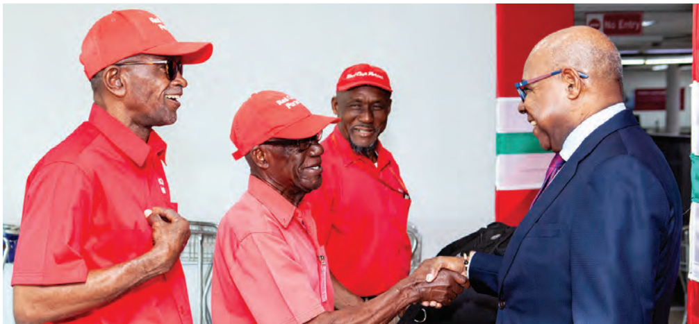
Minister Bartlett engages with Red Cap Porters at the Norman Manley International Airport, during a recent visit.