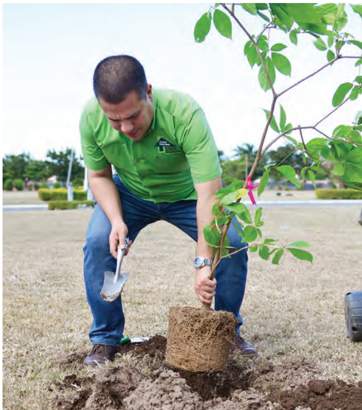
Senator Matthew Samuda, plants a sapling at Jamaica House as part of the launch of the urban tree-planting thrust.