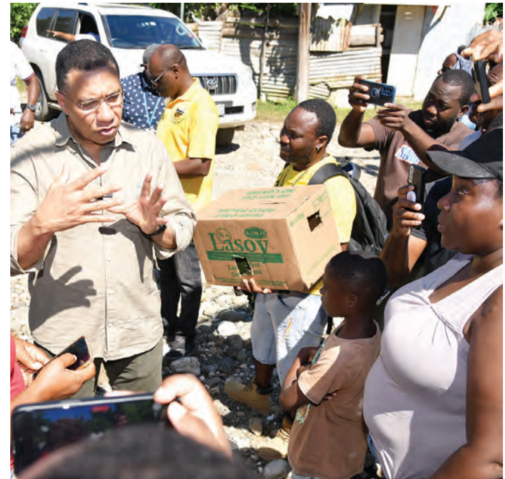
Prime Minister the Most Hon. Andrew Holness in conversation with residents of Dalvey in St. Thomas during a tour of the parish on November 19 to assess flood damage.