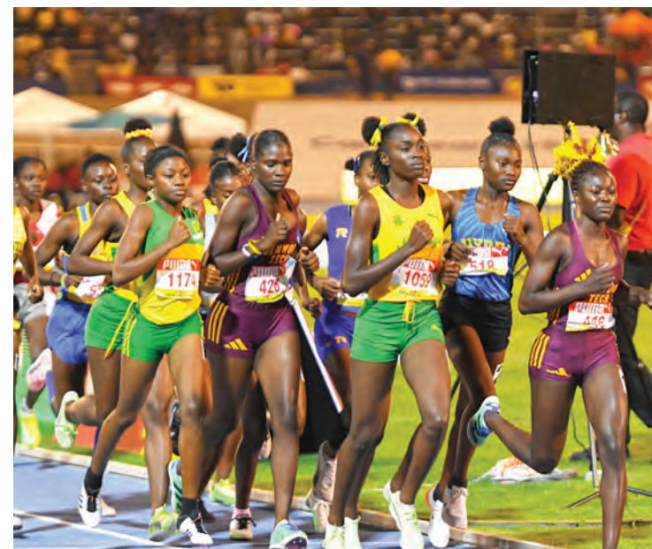
Athletes compete in the Girls 13 to 19, 3000 metre race during the 2023 ISSA/GraceKennedy Boys and Girls Championships at the National Stadium on April 1.