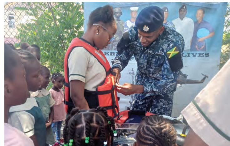
A service member from the First District, Jamaica Defence Force Coast Guard, fits a life vests on a student, during Girls' Day activities at Old Pera Primary School in St. Thomas.