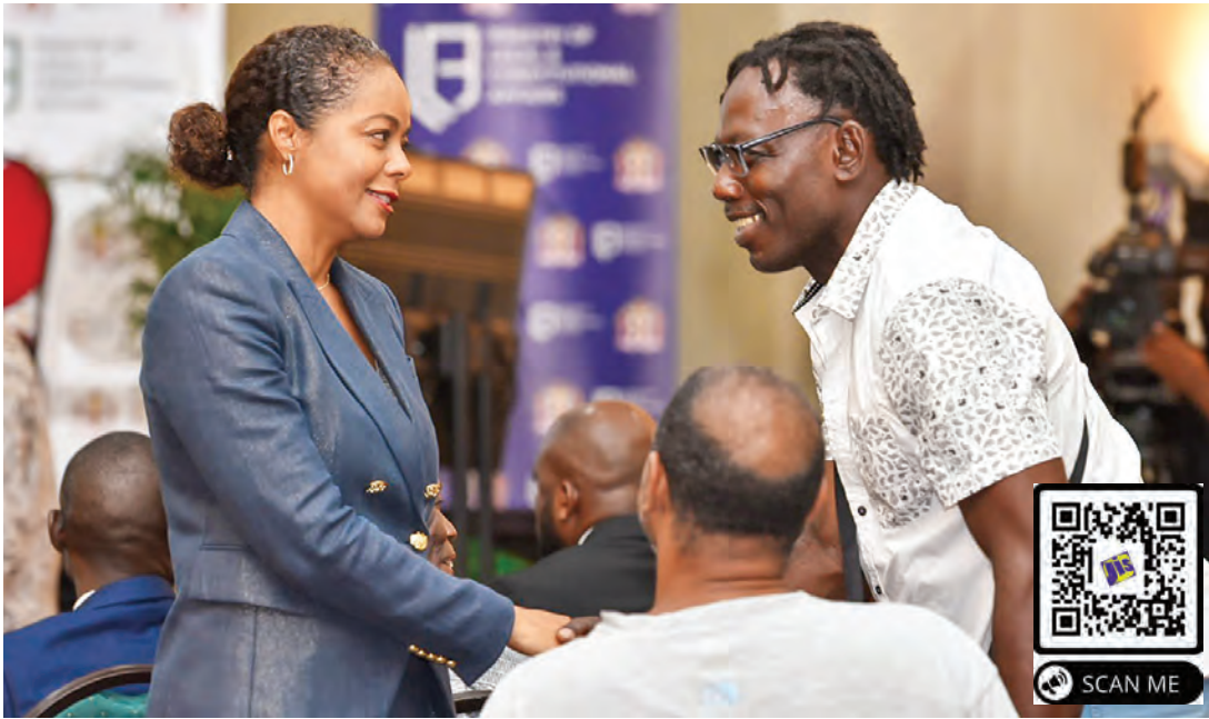
Minister of Legal and Constitutional Affairs, Hon. Marlene Malahoo Forte, engages with a member of the public at a Constitutional Reform town hall in Montego Bay.