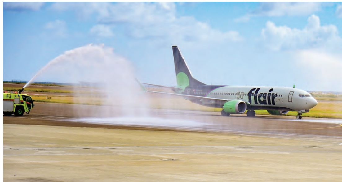
The inaugural Flair Airlines flight from Toronto, Canada, is given the traditional welcome on arrival at the Norman Manley International Airport in Kingston in December.