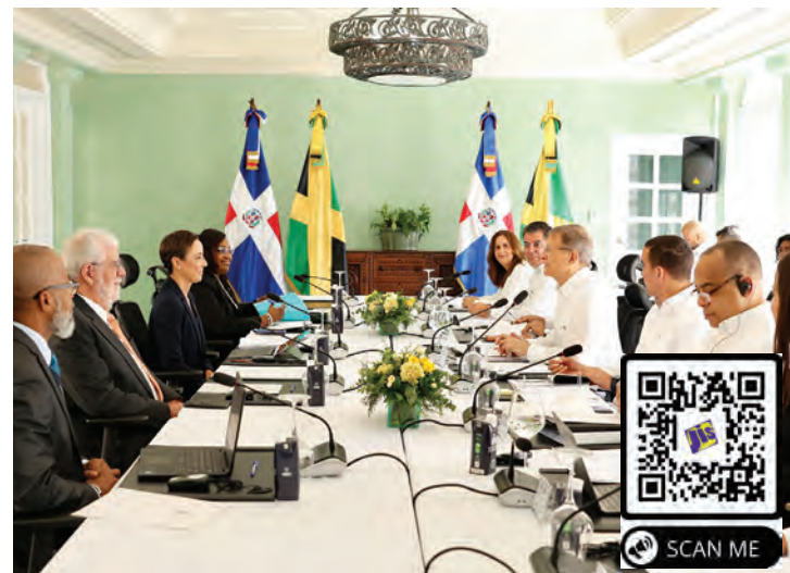
Minister of Foreign Affairs and Foreign Trade Senator the Hon. Johnson Smith (3rd left), leads Jamaica's delegation at the first Political Dialogue with the Dominican Republic, marking the beginning of a new era of cooperation and shared insights between the two countries.

consultations; the Republic of Korea on cooperation for grant aid; Barbados on deepening bilateral cooperation in trade, investment, tourism, the medical cannabis industry, education, culture, and sports; and the Dominican Republic through the Institute of Higher Education in Diplomatic and Consular Training (INESDyC).