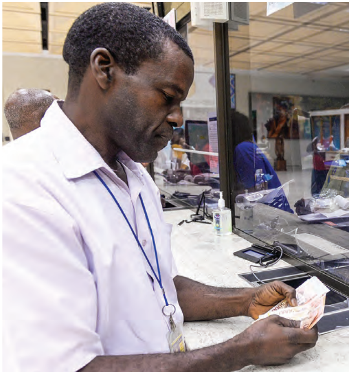
A customer conducting a transaction using the new Polymer Bank Notes. The series was officially released into circulation in June. The suite comprises the upgraded $50, $100, $500, $1,000, and $5,000 notes, and the newly introduced $2,000 bill.