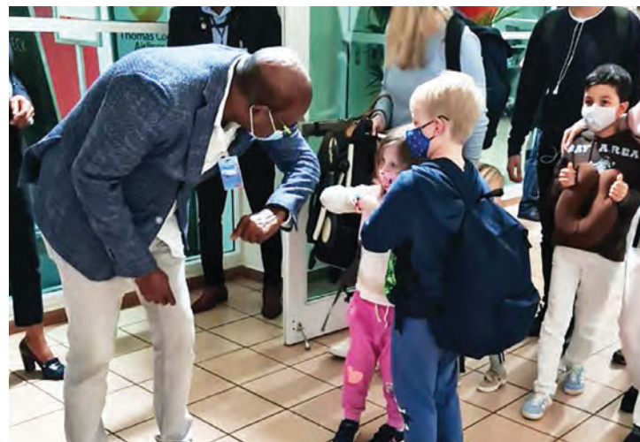
Minister of Tourism, Hon. Edmund Bartlett (left), engages with children who arrived on a British Airways flight out of Gatwick London Airport, which landed at the Sangster International Airport in Montego Bay in December.