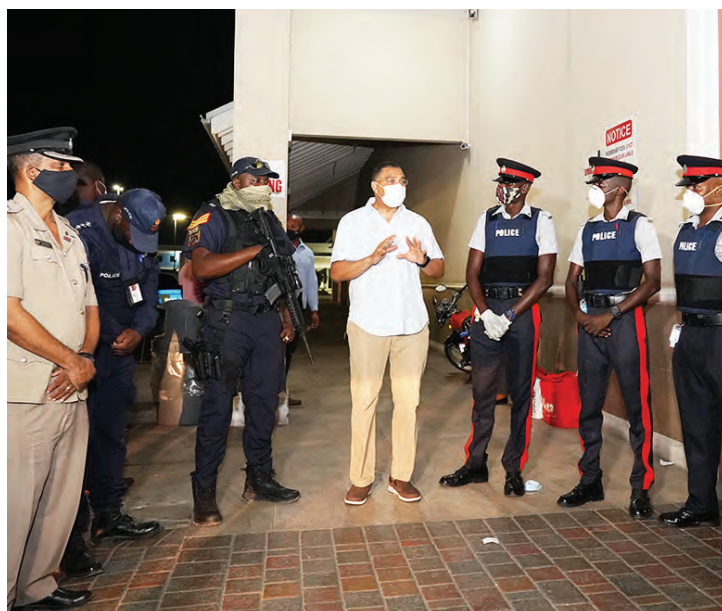
Prime Minister the Most Hon. Andrew Holness converses with police officers working on the front-lines on the COVID-19 pandemic.