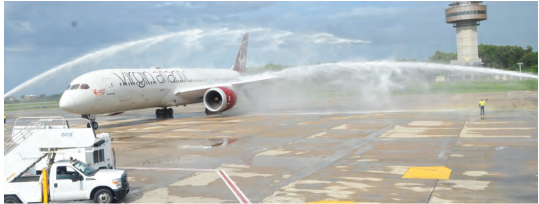
The Virgin Atlantic plane carrying passengers and crew from London, England, taxis beneath the symbolic water arch welcome at the Sangster International Airport in Montego Bay, St. James, following resumption of the airline's scheduled flights to the island in October.

defined contributory plan requiring mandatory contributions from employers and workers.