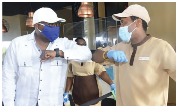
Minister of Tourism, Hon. Edmund Bartlett (left), bumps elbows with houseman at the Riu Negril hotel in Westmoreland, Kerry Waugh, during a walk-through of the property in July. The Minister visited a number of tourism entities in the parish to get a first-hand look at the level of compliance with COVID-19 protocols.