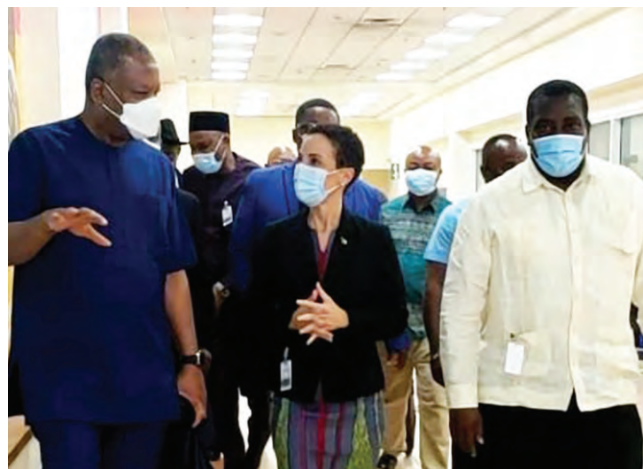
Minister of Foreign Affairs and Foreign Trade, Senator the Hon. Kamina Johnson Smith (centre), converses with Nigeria's Foreign Affairs Minister, Geoffrey Onyeama, following the arrival of a historic direct flight from Lagos, Nigeria, at the Sangster International Airport in Montego Bay, St. James, in December. At right is Minister of Transport and Mining, Hon. Robert Montague.