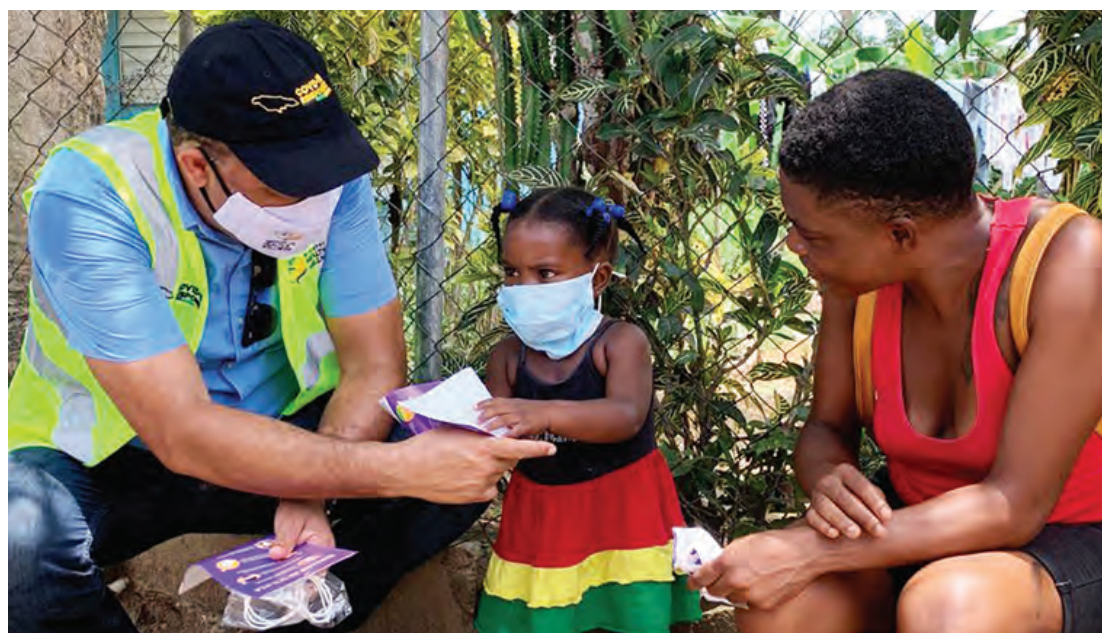
Minister of Health and Wellness, Dr. the Hon. Christopher Tufton, interacts with a toddler in the Bottom Town community in Clark's Town, Trelawny, in July, while her mother looks on. Occasion was a sensitisation walk in the community, which recorded two imported cases of COVID-19.