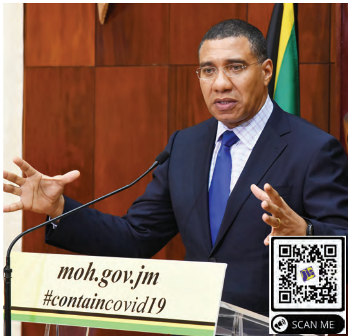
Prime Minister the Most Hon. Andrew Holness leads fight against COVID-19.