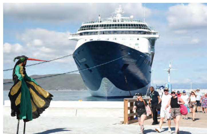
Passengers disembark the Marella Discovery 2 cruise ship, at the Port Royal Cruise Port in Kingston.