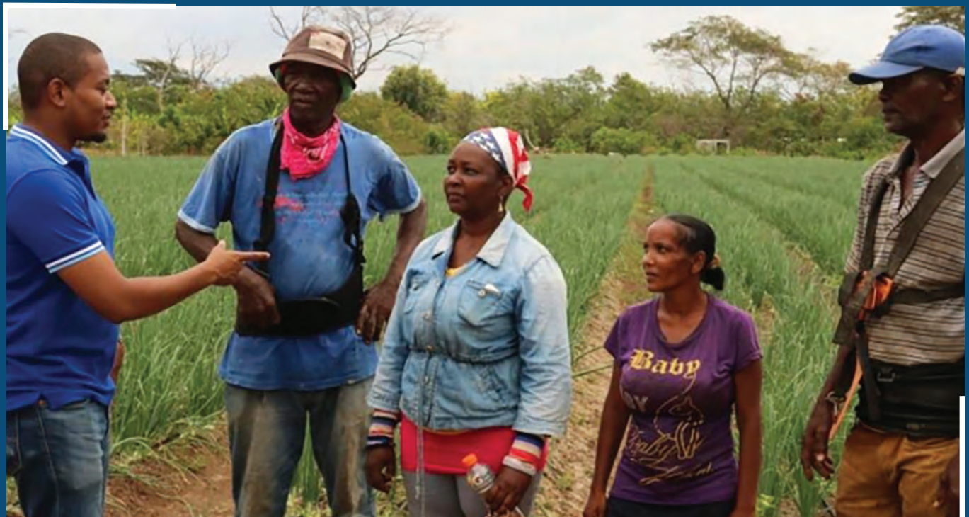
Minister of Agriculture and Fisheries, Hon. Floyd Green, speaks with farmers during a tour of a farm in St. Catherine in March.

both the Norman Manley and Sangster International Airports to reduce the risk of plant and animal pests entering the country.