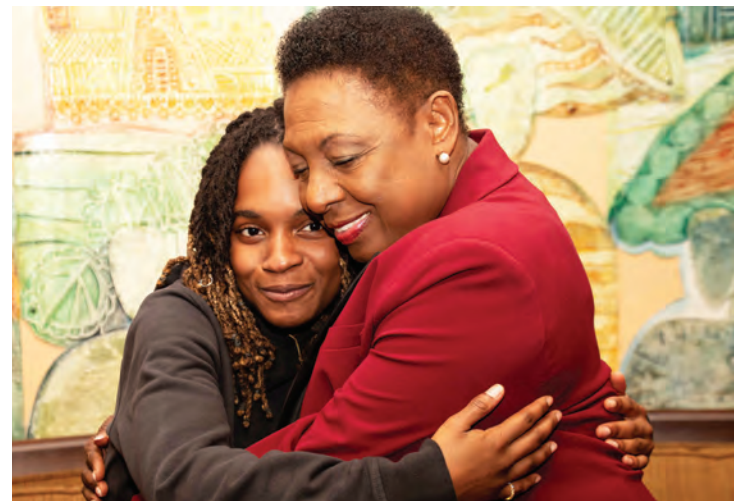
Minister of Culture, Gender, Entertainment and Sport, Hon. Olivia Grange (right), embraces Grammy-winning Reggae artiste, Koffee, at Norman Manley International Airport. The Minister went to welcome home the singer who won the Grammy Award for Best Reggae Album in January 2020.