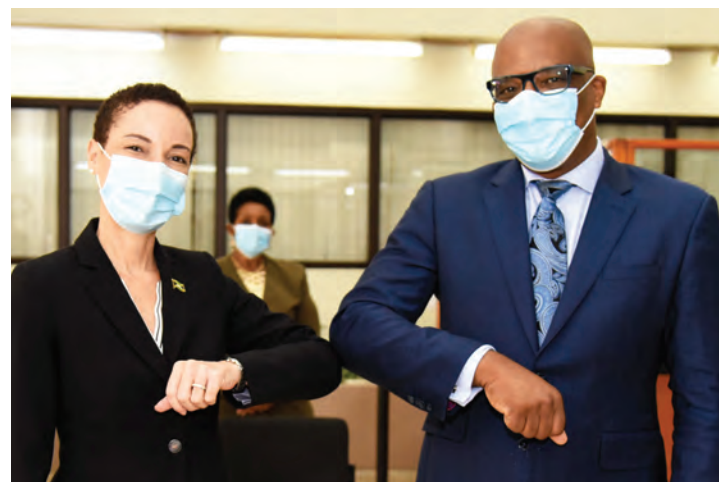
Minister of Foreign Affairs and Foreign Trade, Senator the Hon. Kamina Johnson Smith, welcomes State Minister, Senator the Hon. Leslie Campbell.