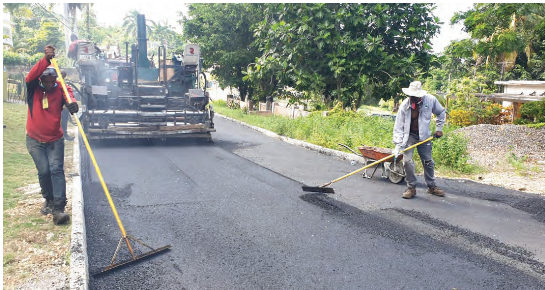
Workmen lay asphalt along a section of the Lagoon View Walk roadway in St. James.