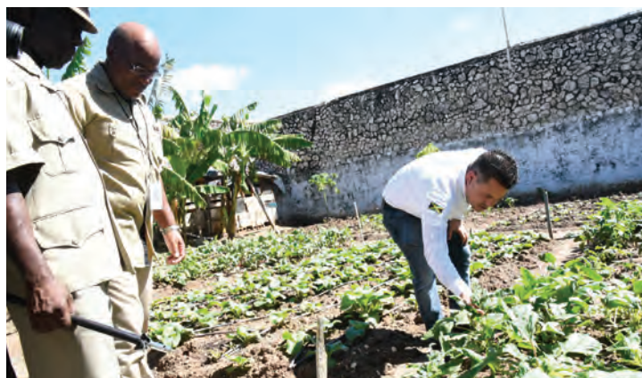
Minister without Portfolio in the Ministry of National Security, Senator the Hon. Matthew Samuda, looks at crops cultivated by inmates at the South Camp Adult Correctional Centre in Kingston, during a tour of the facility early March.