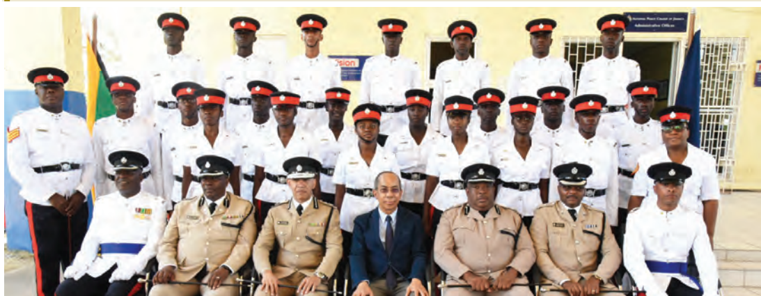
National Security Minister, Hon. Dr. Horace Chang (centre, seated), Commissioner of Police, Major General Antony Anderson (3rd left); and other Senior Officers of the Jamaica Constabulary Force (JCF), with a batch of new constables at a passing out parade and awards ceremony, held at the National Police College of Jamaica in St. Catherine. A total of 332 new constables graduated.