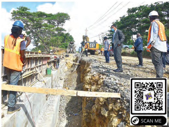
Prime Minister the Most Hon. Andrew Holness (2nd right), observing construction activities on the Southern Coastal Highway Improvement Project (SCHIP) in Portland in July.