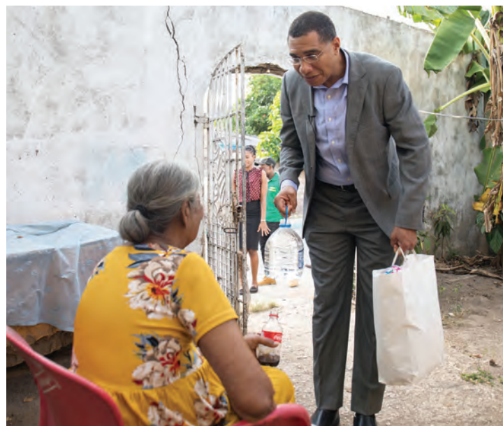
Prime Minister Holness converses with an elderly resident of West Central St. Andrew while handing out care packages in the community.