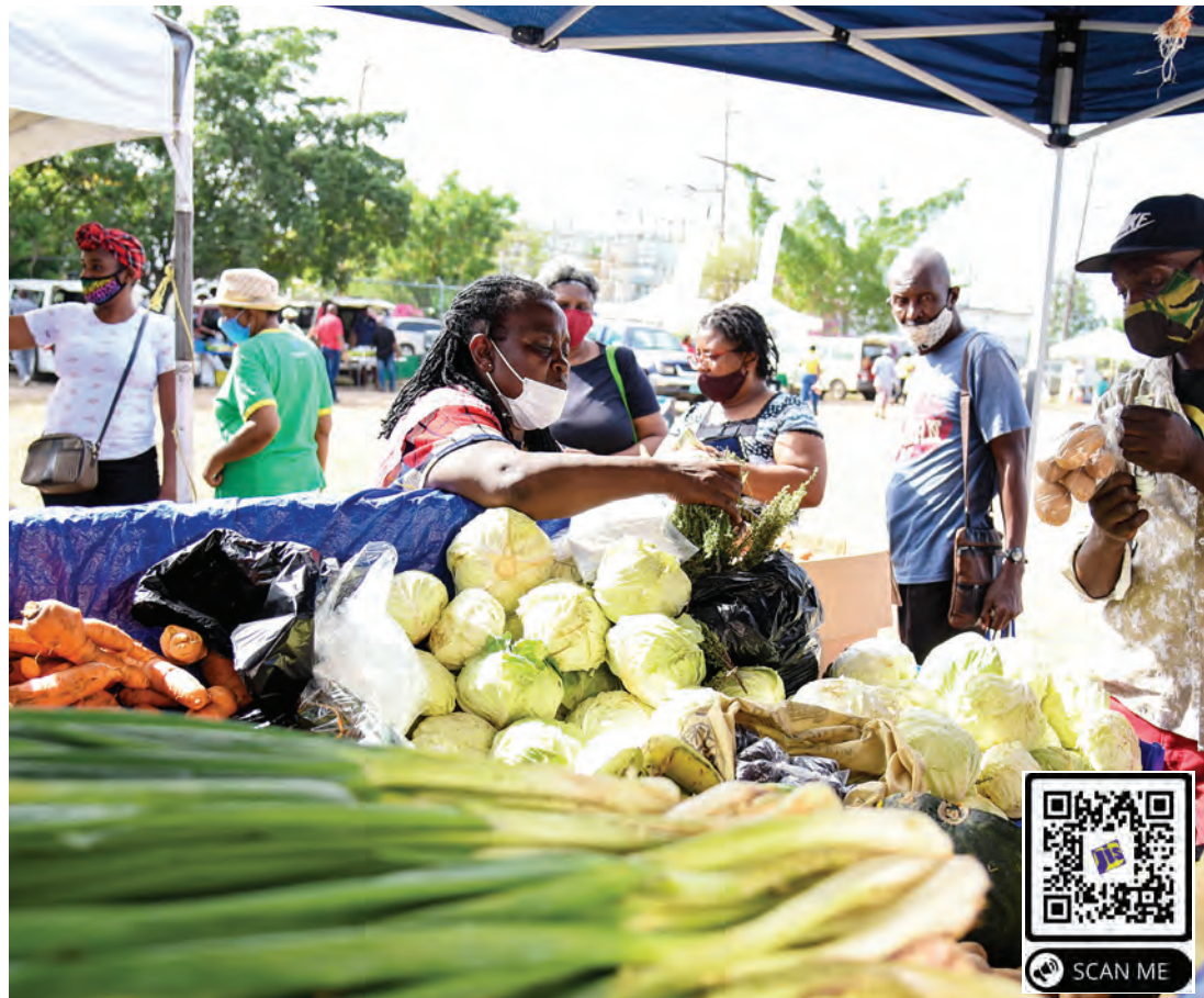
Customers flock a farmers' market held at the Ministry of Industry, Commerce, Agriculture and Fisheries playfield, in St. Andrew in July.