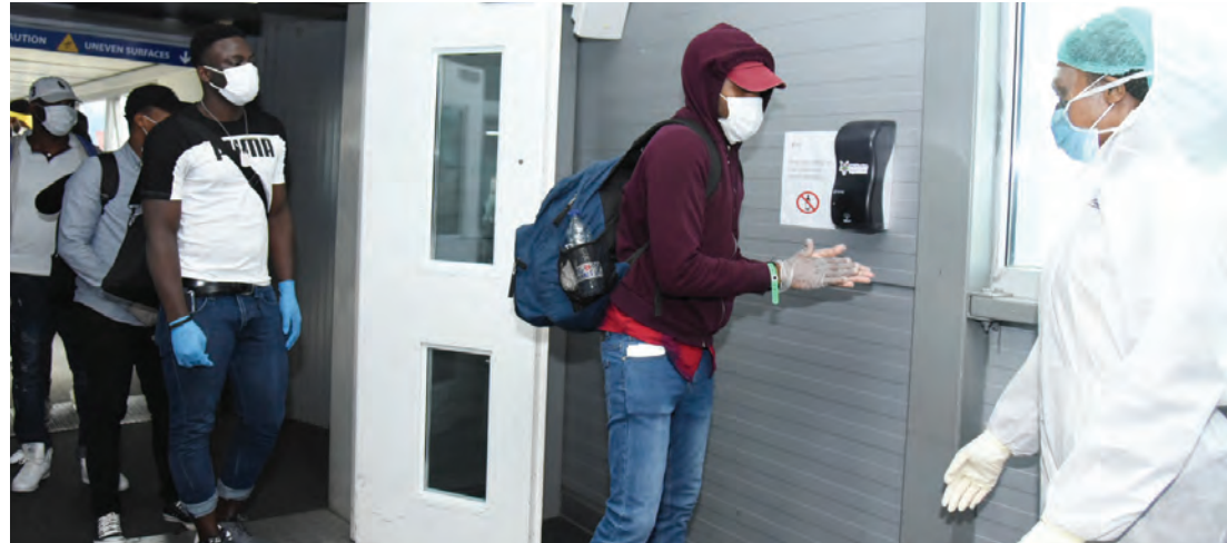
Residents returning from the United Kingdom sanitise their hands after disembarking the aircraft at the Norman Manley International Airport in Kingston in May.