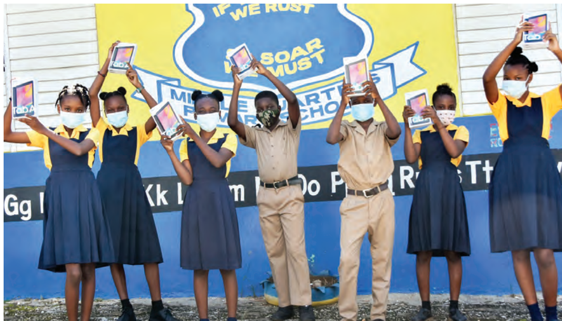
Students of Middle Quarters All-age School in St. Elizabeth show off tablets donated by the Sandals Foundation under the Government's 'One Tablet or Laptop per Child' initiative.