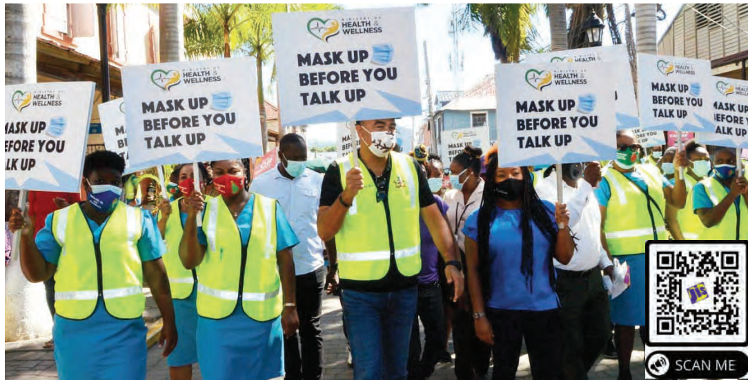
Minister of Health and Wellness, Dr. the Hon. Christopher Tufton, leads a team of health workers through Falmouth, Trelawny, in December following the launch of the 'Mask Up Before You Talk Up' COVID-19 sensitisation blitz.