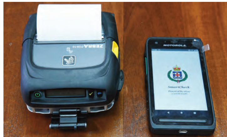
A smart android device and portable printer that will be carried by Traffic Police in the Corporate Area to facilitate the issuance of electronic traffic tickets.