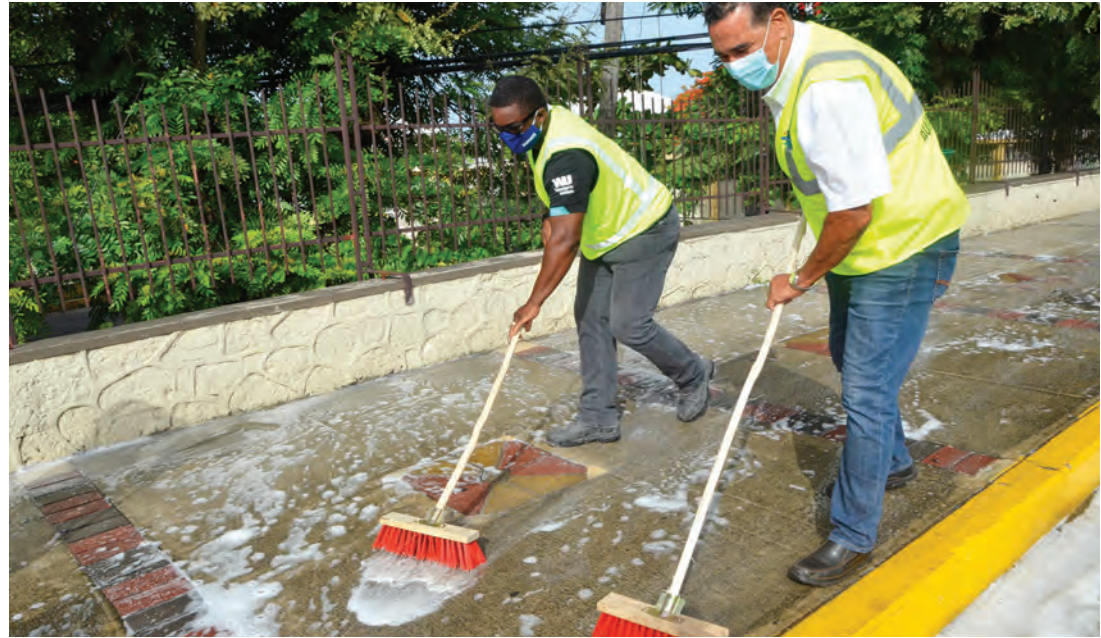
Minister of State for Local Government and Rural Development, Hon. Homer Davis (right); and Member of Parliament for Central St. James, Heroy Clarke, scrub a sidewalk along St. James Street, during a sanitisation exercise in Montego Bay in June.

donated by the United States (US) Embassy in Kingston, and the Department of Defence, US Southern Command, to boost local disaster relief capacity.