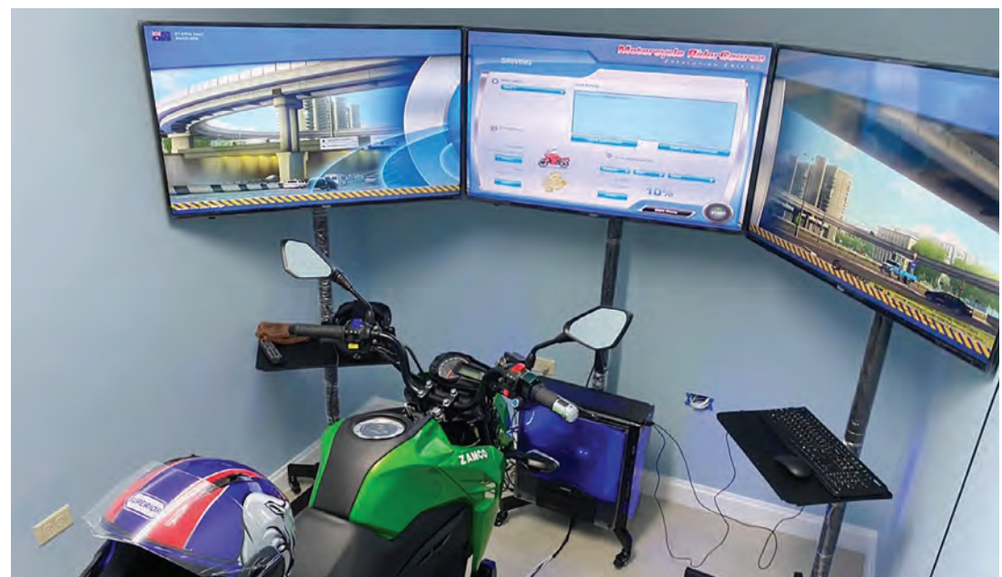
The $52 million motorcycle training simulator installed at the Petersfield Vocational Training Centre in Westmoreland, which is intended to reduce road fatalities.