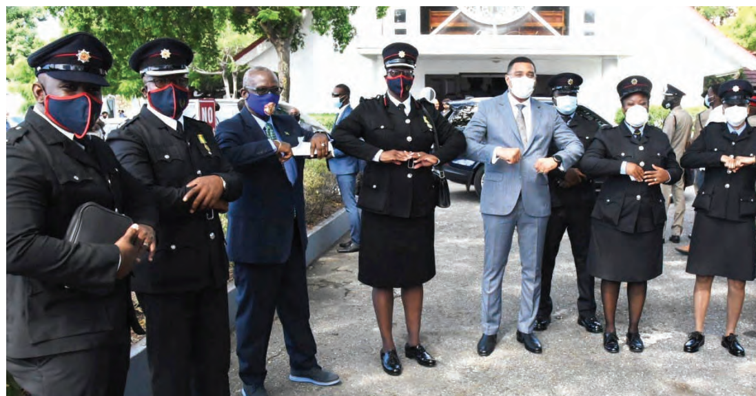
Prime Minister the Most Hon. Andrew Holness (5th left) and Minister of Local Government and Community Development, Hon. Desmond McKenzie (3rd left), with members of the Jamaica Fire Brigade during a special service at the Webster Memorial United Church in St. Andrew on July 19 to recognise the country's front-line workers, who have been integral in the fight against the coronavirus disease (COVID-19).