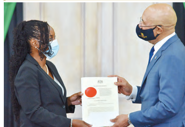
Governor-General, His Excellency the Most Hon. Patrick Allen, congratulates new Minister of State in the Ministry of Finance and the Public Service, Hon. Marsha Smith, as he presents her with the Instrument of Appointment during the swearing-in ceremony at King's House in September.