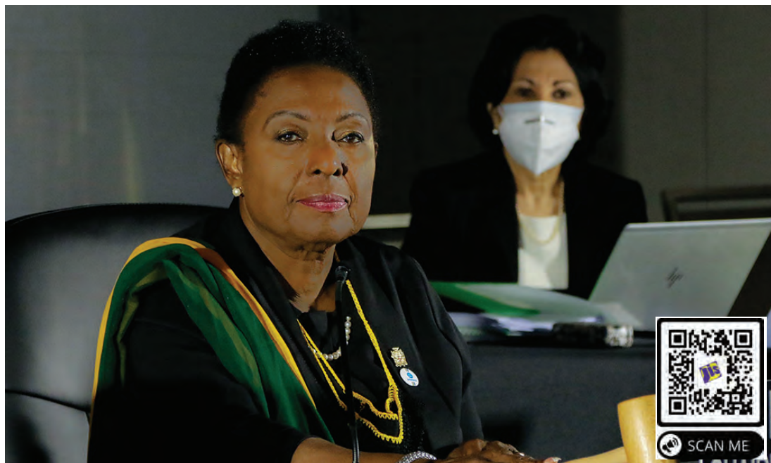
Minister of Culture, Gender, Entertainment and Sport, Hon. Olivia Grange, chairs the virtual meeting of the UNESCO Intergovernmental Committee for the Safeguarding of Intangible Cultural Heritage.