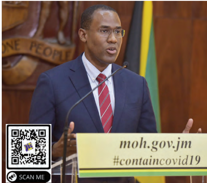
Minister of Finance and the Public Service, Dr. the Hon. Nigel Clarke gives an update on the CARE Programme.